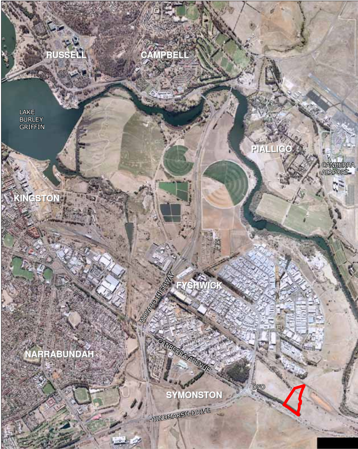
Figure 1.2.2 Area of Section 87 and part Sections 83 and 85 Fyshwick