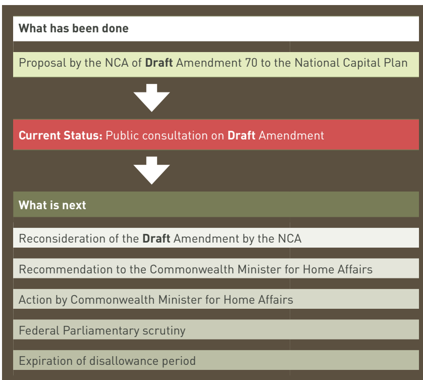
Figure 1.3 Outline of the Draft Amendment Process

The process for making an amendment to the Plan is outlined in Figure 1.3